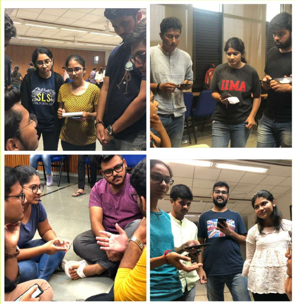
Detectives in making!