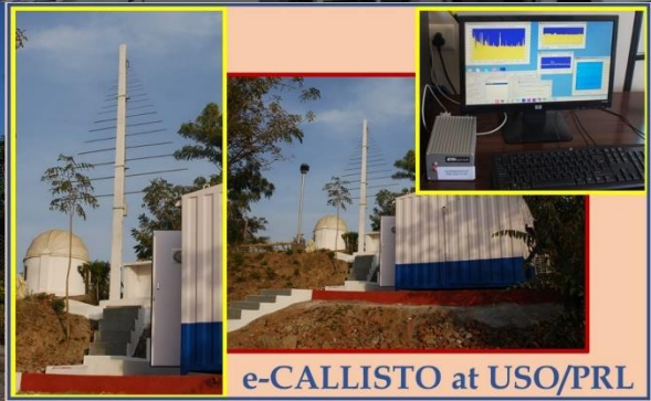
e-CALISTO at USO/PRL