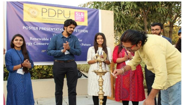
Glimpses of Lamp-lighting ceremony by the jury and organizers to inaugurate the poster presentation competition